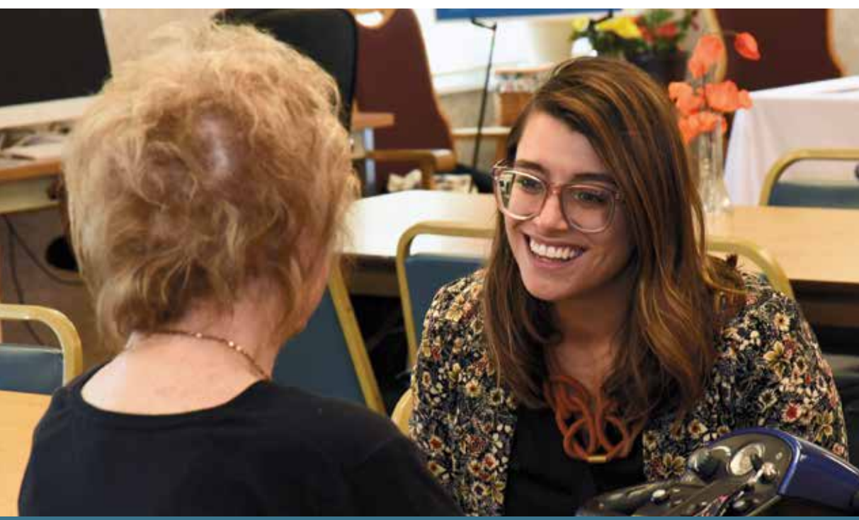
Representing Etna, Millvale, parts of Pittsburgh, and Shaler and Reserve townships